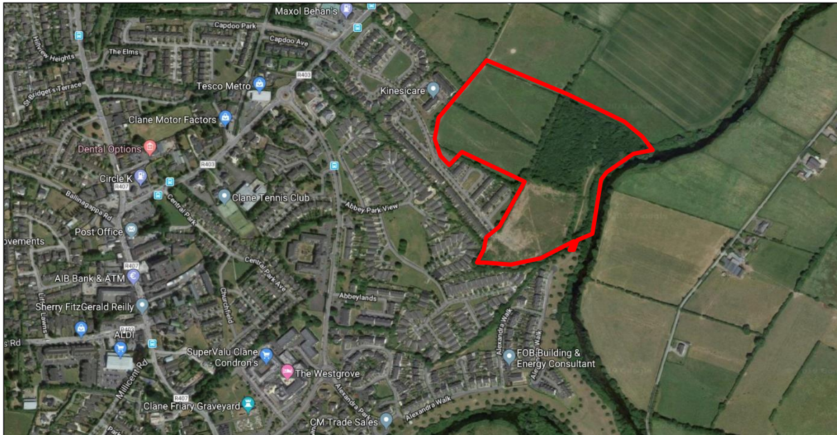
Figure 1.0 Aerial view of subject site (red outline) in the context of the immediate area.

The site benefits from an excellent public transport network. The site is located a 4-minute walk (approximately) from the R403/Maxol bus stop which serves Go Ahead bus route no. 120. This service operates 7 no. days a week from 5:53am to 00:14 am, running, on average, 1 no. bus per half hour. A second bus stop is located 11 minutes (approximately) from the site which serves Transport for Ireland route 139. This is a daily service, which runs one bus an hour between 7:20am to 23:30pm. An additional bus stop located at Cloisters nearby, serves route 846 which is provided by JJ Kavanagh & Sons. The bus services provide regular access to Connolly and Heuston Stations, University College Dublin, Dublin City Centre, Liffey Valley, Naas, Celbridge and more. The 139 bus route will provide direct access to the upcoming Maynooth DART line which will run 9 daily return trips.